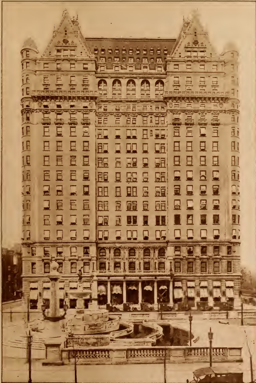
HOTEL PLAZA, at 59th Street and 5th Avenue. One of the exclusive hotels in the city. It is a model of beauty and cost $12,500,000.